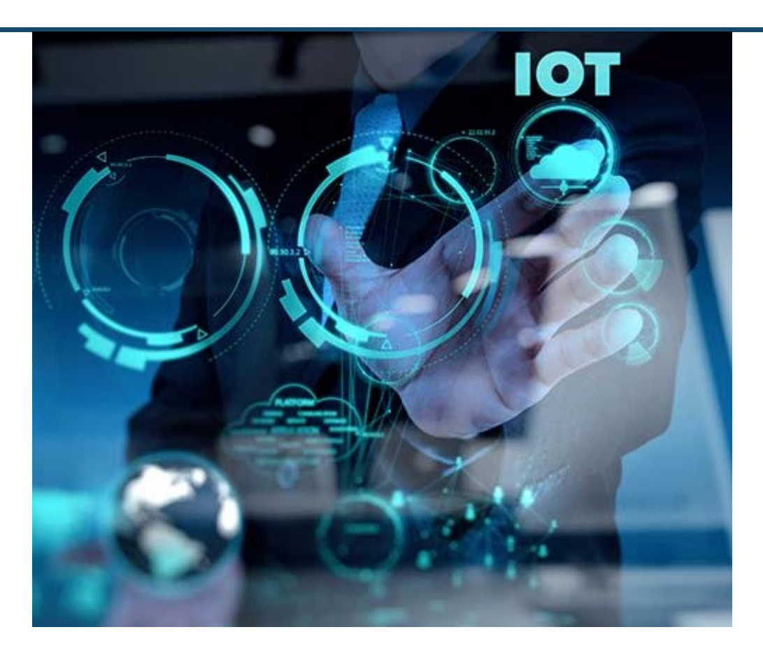
AR is the Human Interface to IoT